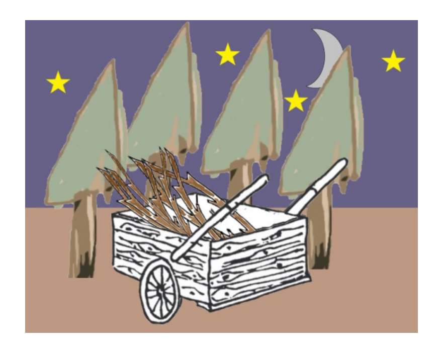
The cart with sticks in the wood