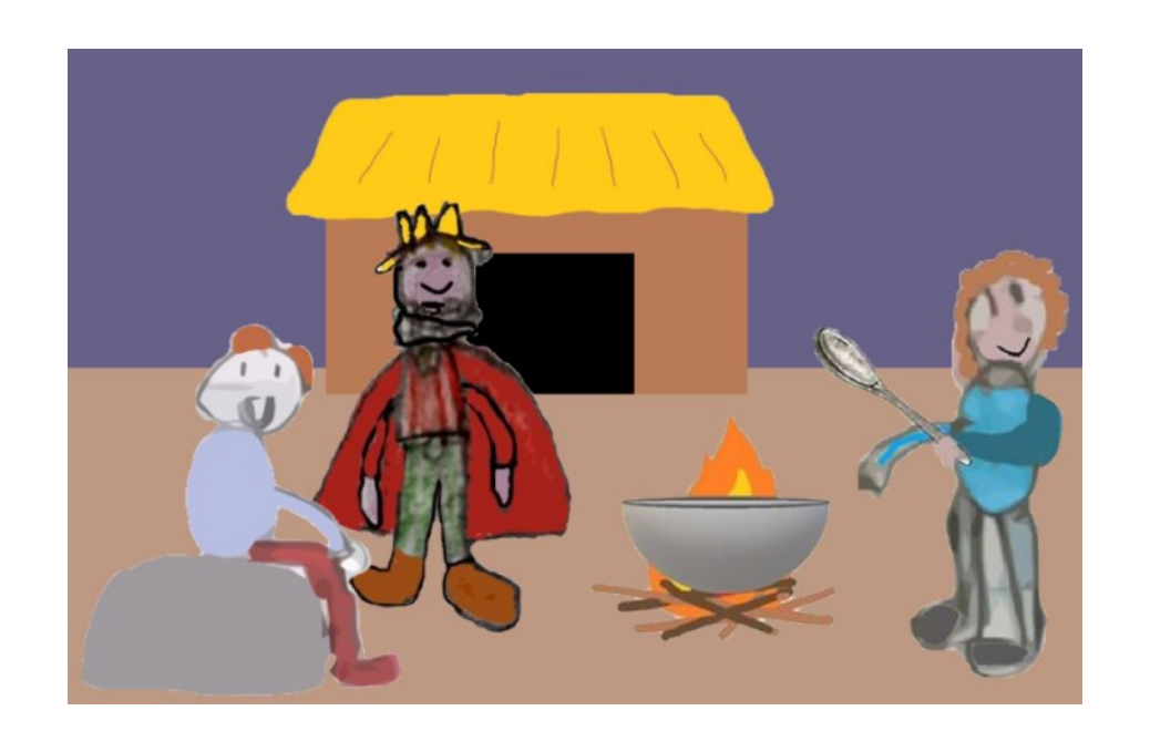
The king, Bill and Jack sit in the dark and munch good food.